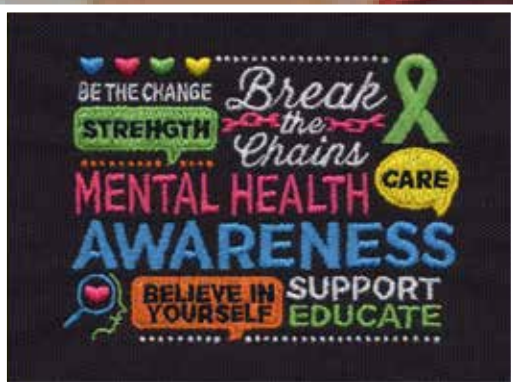
Close up of design

ALL ORDERS MUST BE SUBMITTED AND PAID BY: