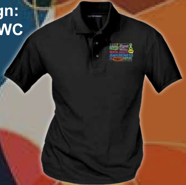
Black and Navy Mens and Womens Polos