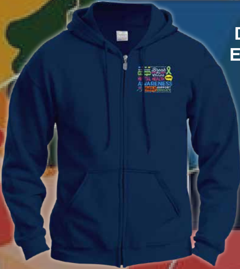
Navy Zip Hooded Sweatshirt